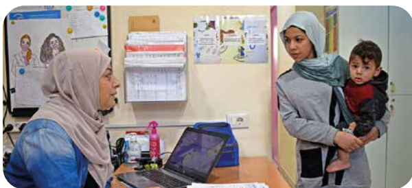
The Tahaddi primary care clinic.

We pray for the Jerusalem Princess Basma Centre's satellite unit in Gaza City. The clinic provides rehabilitation services for children with disabilities. Many of their patients are those who suffered life-changing injuries in the recent conflict. To tackle the psychological trauma many children suffered, the clinic now offers play therapy as part of their treatment.