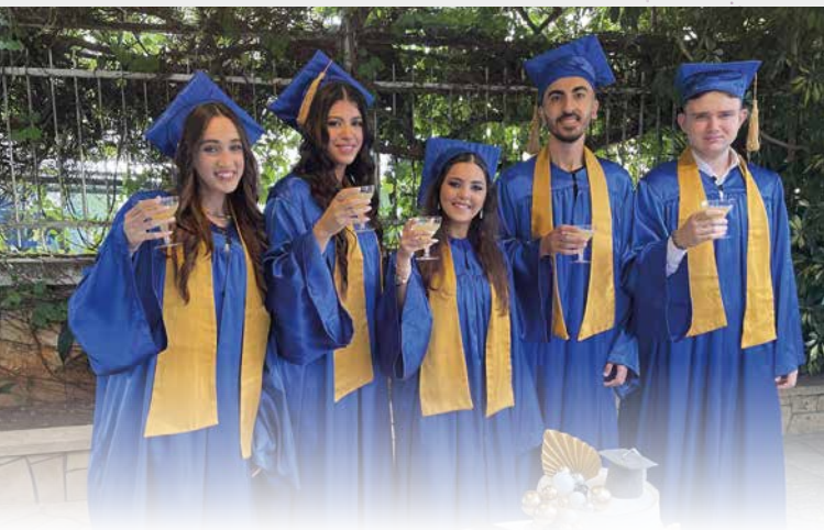
The Learning Centre for the Deaf high school graduates.